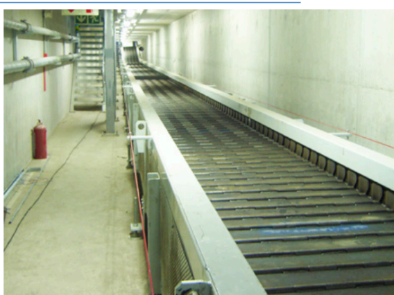
In-ground line for offcuts