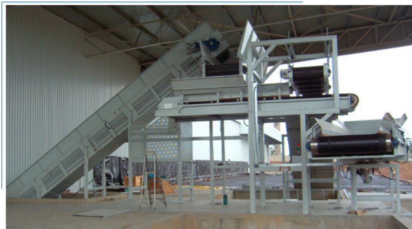
Aluminium and steel offcuts conveying line