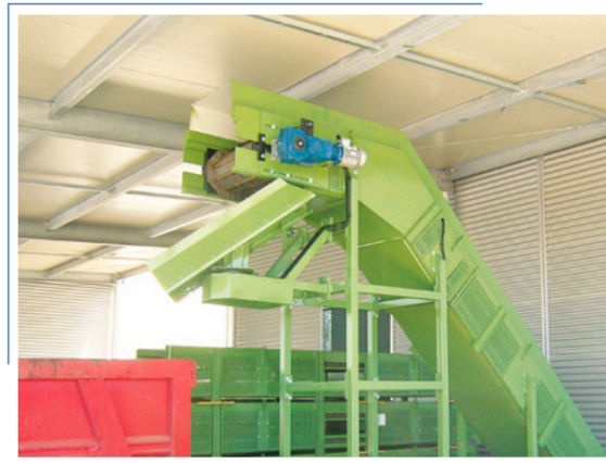
Detail of the discharge into container