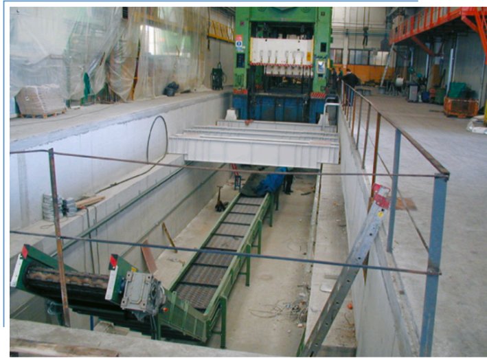
Swarf conveying line, under a press