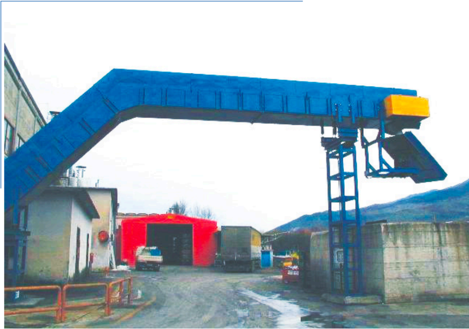
Heavy conveyor for scraps discharge